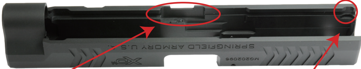
Slide Release Spacer

Install slide release spacer after installing blowback housing. It is fixed by one pc of screw.